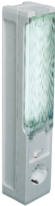
Lamp shown with protective plastic cover (see Accessories)